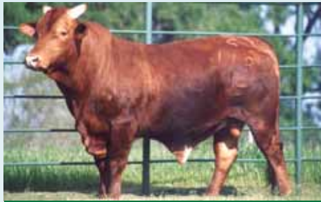
L Bar 2118 BW -0.5 WW 15 YW 17 TMAT 12 SC -0.3