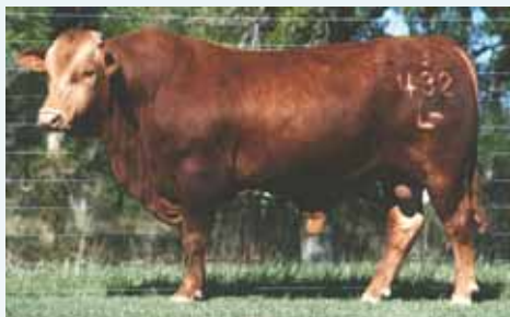
L Bar 3432 BW WW 28 YW 39 TMAT 10 SC