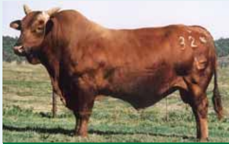
L Bar 0324 BW -0.4 WW 6 YW 12 TMAT 2 SC 0.4