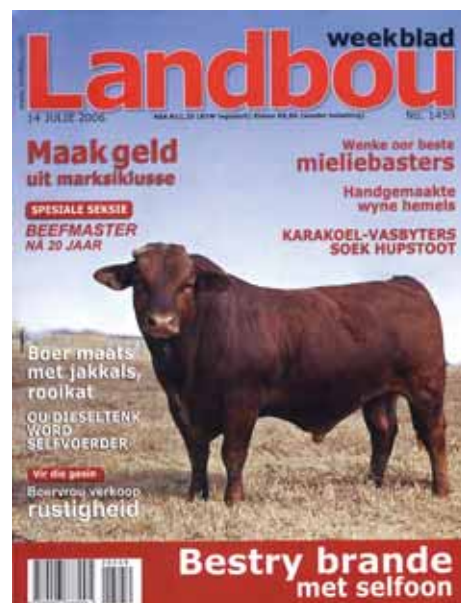
An L Bar 7499 son on the cover of South Africa's leading cattle publication

Congratulations to the South African Beefmaster Association on 20 great years and, more importantly, on becoming the third-largest breed in the nation!