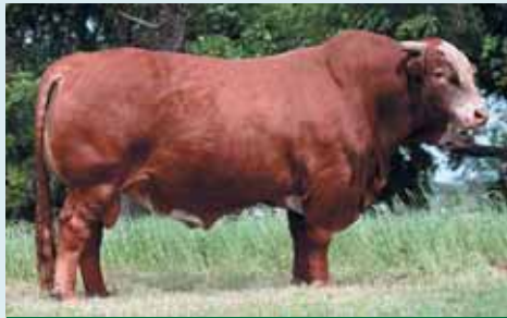
L Bar 5502 BW 1.6 WW 30* YW 42* TMAT -8 SC 0.4* *Trait Leader

Sale Day Semen Special: 20% off 20 or more straws