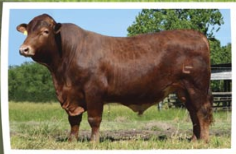
L BAR EN FUEGO —Long, red, straight, clean and polled. Classified U 1/2.

In the 2012 Beefmaster Sire Summary, 35 trait leaders are L Bar bulls or their sons—that's 33% of leaders originating from one bull sale!